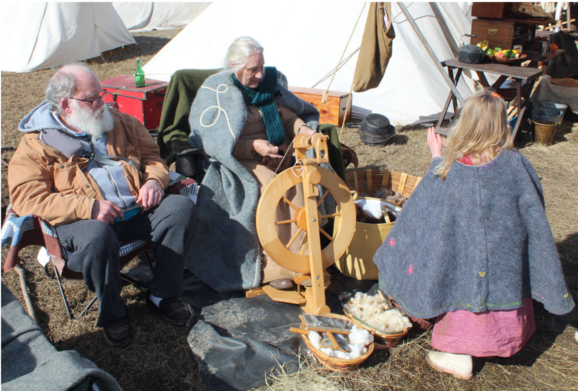
WEAVING YARN FROM COTTON